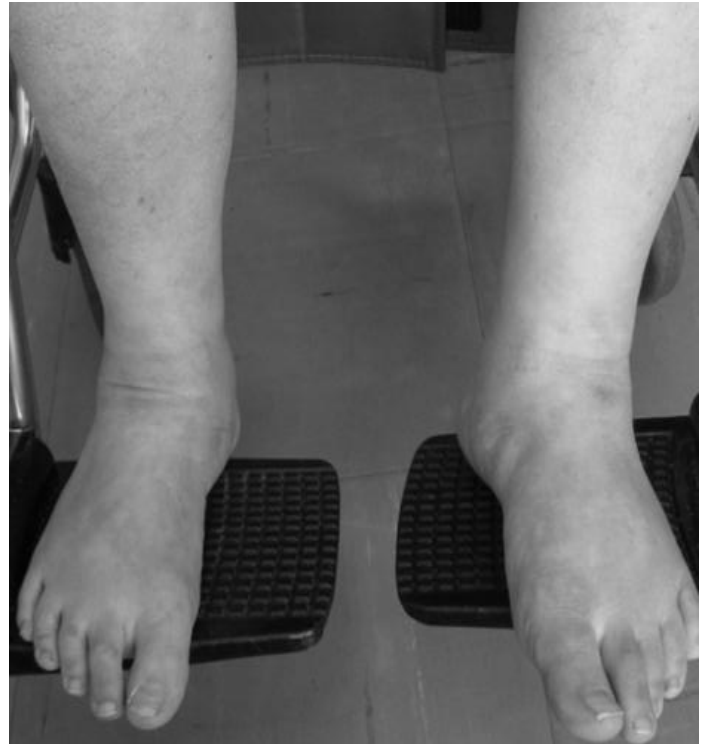
Figure 2. Appearance of livedo reticularis on the patient's feet.

ven's colored progressive matrices test were impossible, and score for the Behavioral Inattention Test was under the cut-off. The patient refused further detailed testing.